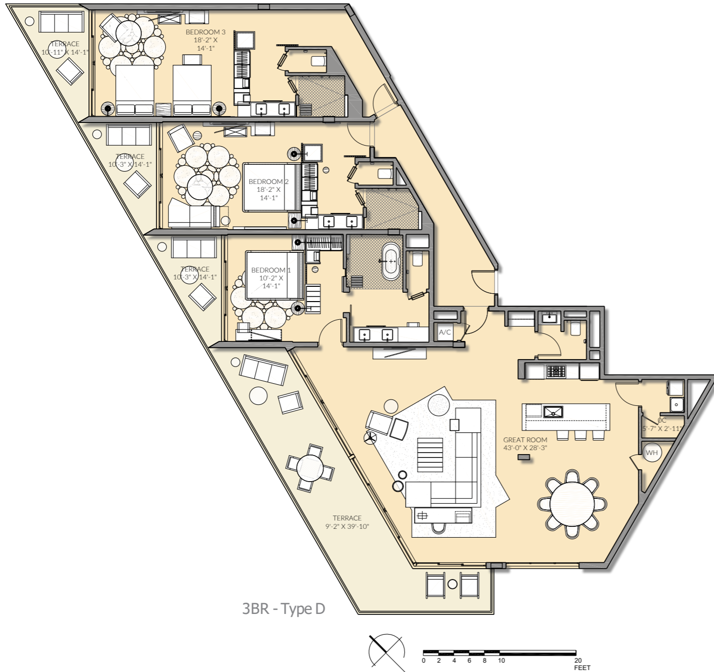
3BR - Type D